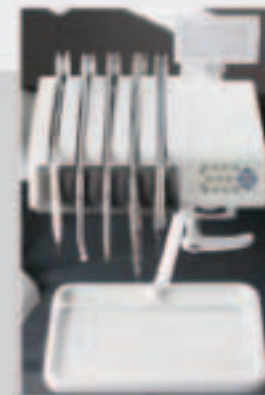
Top mounted instrument tray

The unit box is 90 degree turnable. It's convenient for the dentist and his/her assistant to operate. The ceramic cuspidor is turnable.