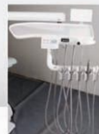
Hanging type instrument tray